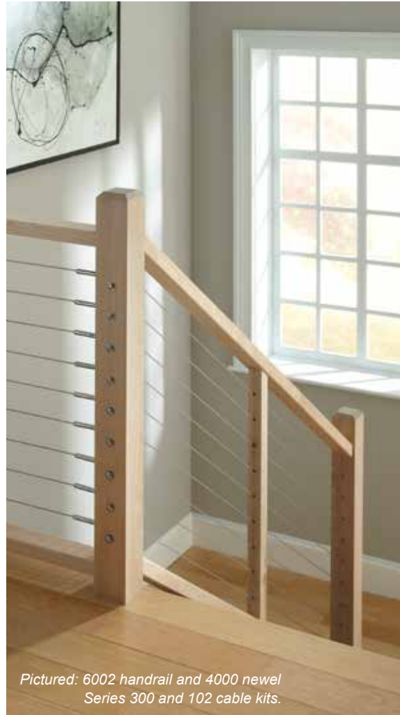
Pictured: 6002 handrail and 4000 newel Series 300 and 102 cable kits.

4000 and 4001 Newels Ideal design for interior cable installations.