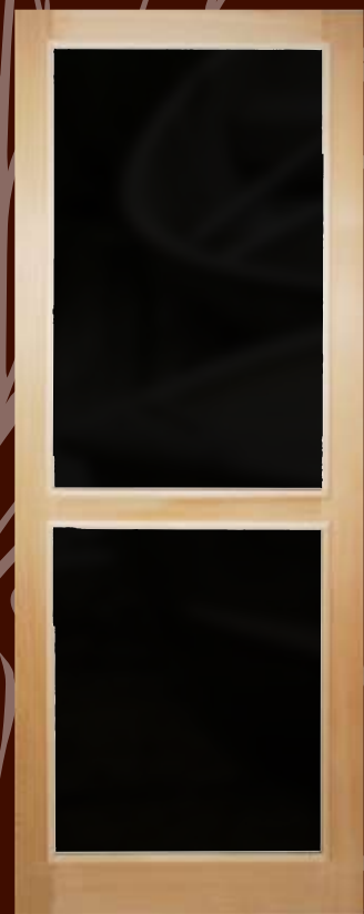
3 Sharp Mountain