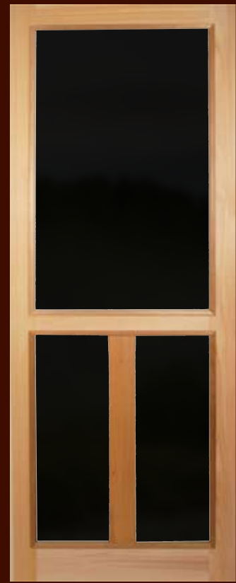
2 River Stone