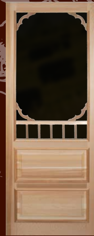
5 Blue Ridge